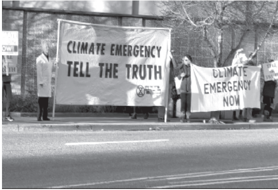
Activists demand that KATU, the local ABC affiliate, broadcast better coverage in "Telling the Truth About Climate Change" (VB #131.11&12)