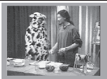
Learning kitchen tips with Connie the Cow in "Vegan Cooking" (VB #19.12&13)

Activists promote Farm Animal Awareness week and describe abuses done to animals who become "dinner." VB #26.5 $8