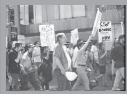
Protestors engage in "Defense Against the Media War on Yugoslavia" in VB #31.7

Grassroots court discusses how the US blockade VB #44.3 $8 violates international law.