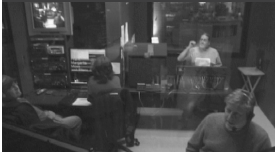
The crew in the studio control room for the "22nd Busiversary" (VB #89.7&8).