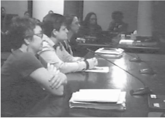
The appellant, an Internal Affairs investigator, and the Citizen Review Committee chair attend a hearing in "City Council Finds Officer Misconduct May 2019" (VB #112.2&3)