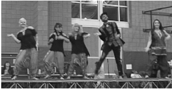
Bollywood dancers are among those featured in "Portland Celebrates Refugees and Immigrants" (VB #107.5&6); see other side for description.