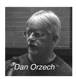
VB #98.11&12 $11

Representatives of a clean power cooperative and an economic development group explain how neighbors, businesses and/or churches can come together to generate renewable electricity.